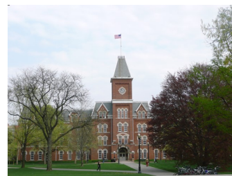
Ohio State University

If you are a self-motivated learner who enjoys meeting new people, and you would like to have a variety of experiences, a large university may be ideal.